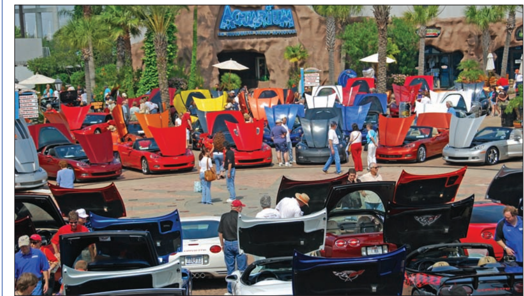
4th Annual San Jacinto Corvette Club "Corvette Show" held at the Kemah Boardwalk, Saturday, March 29th, 2008 with proceeds benefitting The 100 Club. 140 Corvettes were entered into the competition from six area Corvette Clubs.