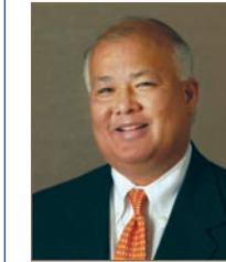
Elected April 2007