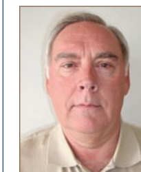
Elected March 2008