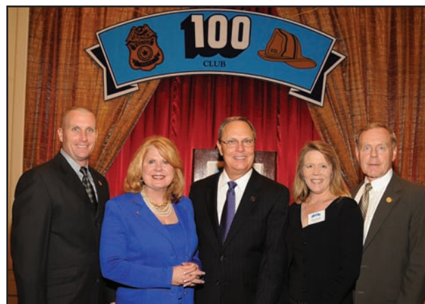
Special thanks to our friends at Chevron for their gift as a Presenting Sponsor.