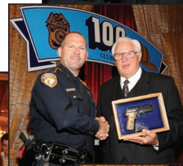
Law Enforcement Sig Sauer Commemorative Pistol